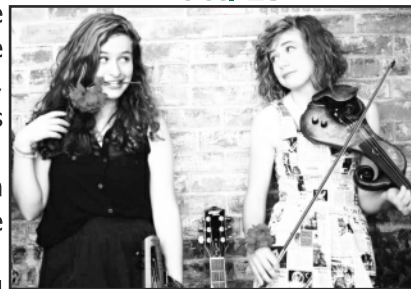
The Accidentals Nov. 27