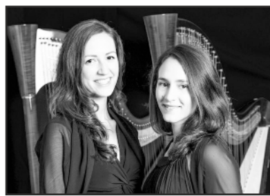
Atlantic Harp Duo Oct. 23