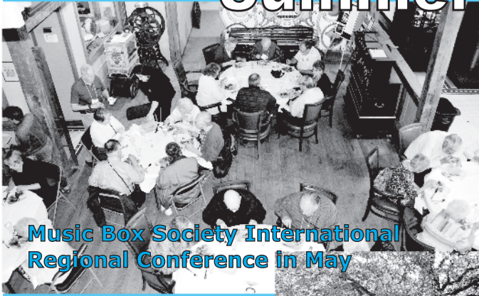
Music Box Society International Regional Conference in May