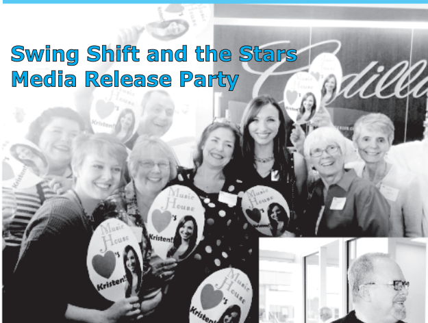
Swing Shift and the Stars Media Release Party