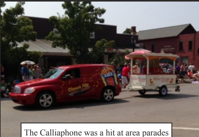
The Calliaphone was a hit at area parades