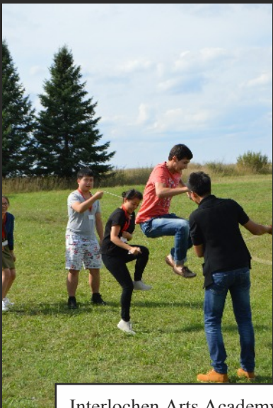
Interlochen Arts Academy Music Department 1 st day of class at the Music House.