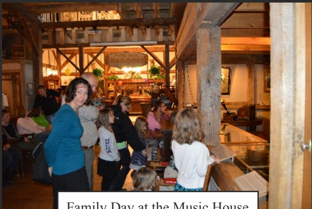
Family Day at the Music House