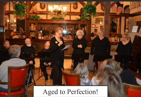
Aged to Perfection!