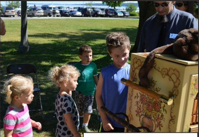
Cherry Festival Fun!