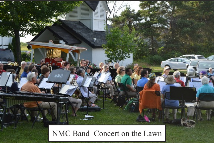
NMC Band Concert on the Lawn