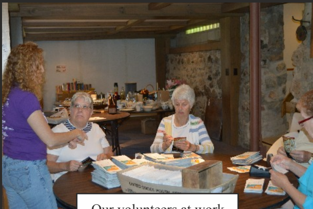
Our volunteers at work